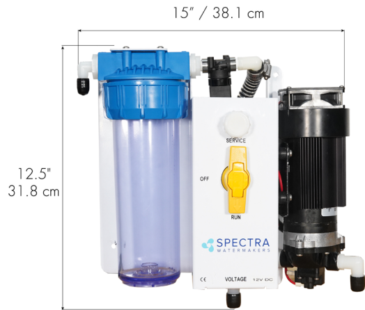
Feed Pump Module Depth 4.5" / 11.4 cm