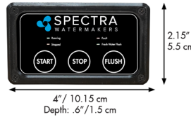
Remote Manual Control Panel