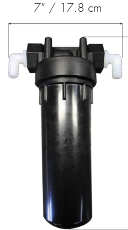
Pre-Filter Depth 6" / 15.2 cm